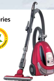
CV-SU23V Silky Red