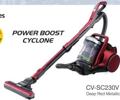
CV-SC230V Deep Red Metallic