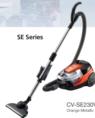
CV-SE230V Orange Metallic